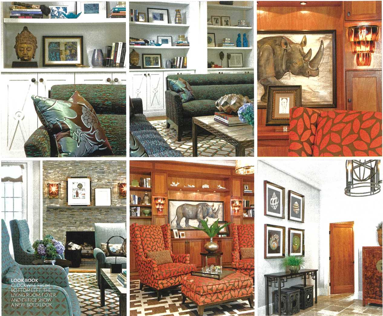
LOOK BOOK CLOCKWISE FROM BOTTOM LEFT, THE LIVING ROOM, FOYER, AND OFFICE SHOW A NEW, BOLD LOOK.